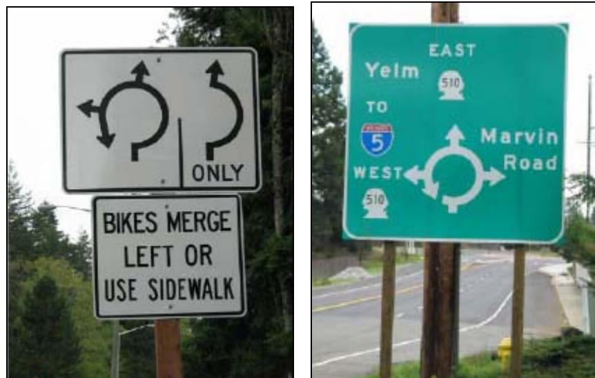
Figure 1: Left – Regulatory Lane Assignment, Right – Advance Guide Sign with Street Names (Difficulty Understanding)